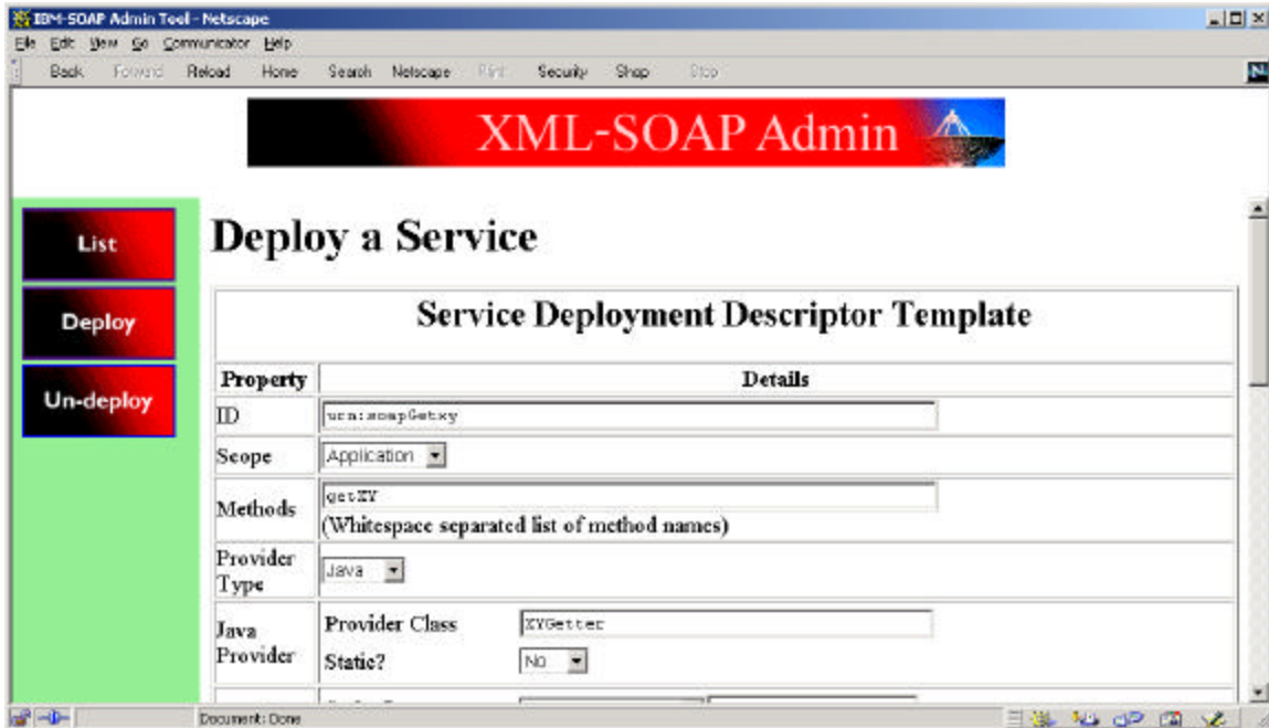
Figure 4 – Deploying a new SOAP service

We also have to specify each of the classes we want to serialize here just as we did in the program. The bottom of the deployment screen is shown in Figure 5.