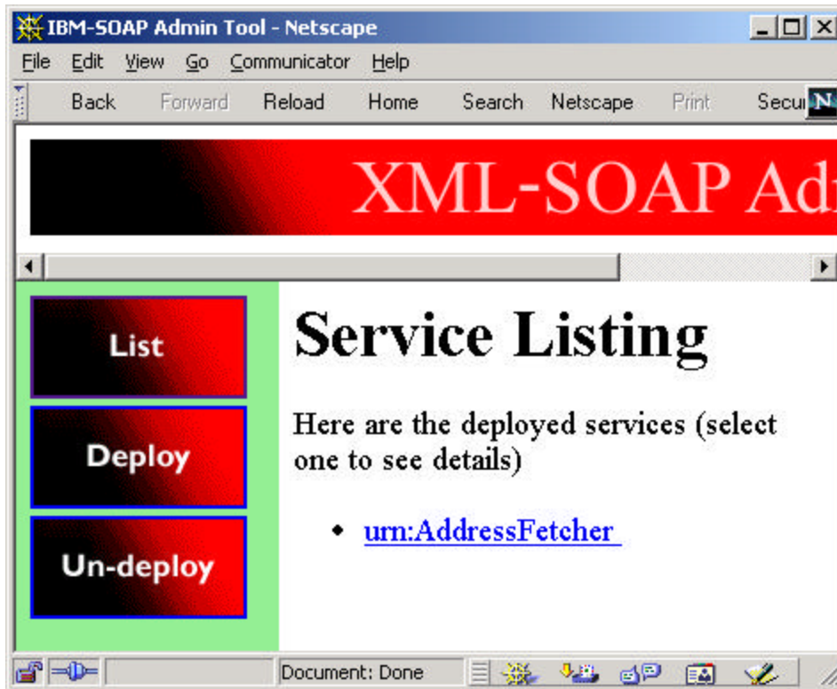
Figure 2 – The AddressFetcher service has been deployed.

If you then click on this urn:AddressFetcher link, you will get a whole blizzard of deployment information. The most important parts of this are