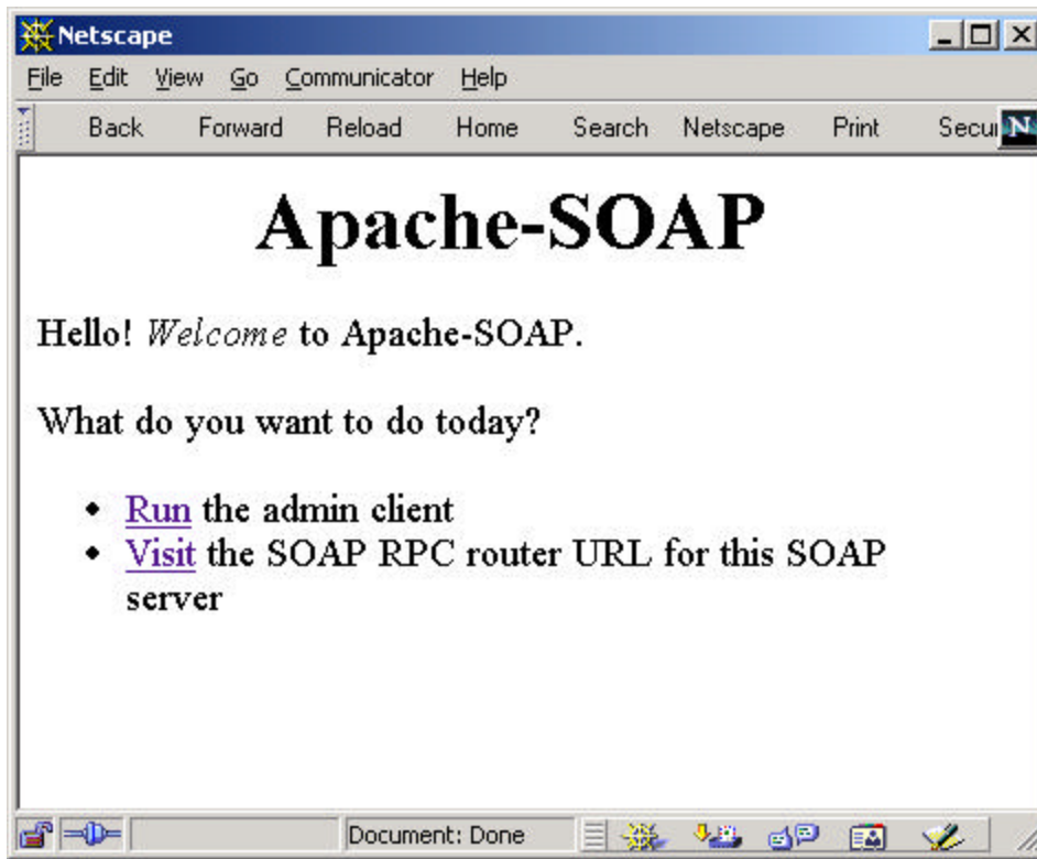
Figure 1 – The Apache-SOAP startup screen.