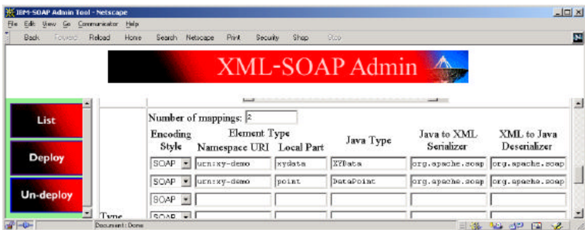
Figure 5 – Registering mappings of two classes

We also have to specify each of the classes we want to serialize here just as we did in the program. The bottom of the deployment screen is shown in Figure 5.